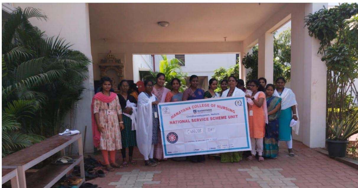
Awareness on Cancer, early Detection & Prompt treatment, Kamakshi Nagar on 6 Dec 2022