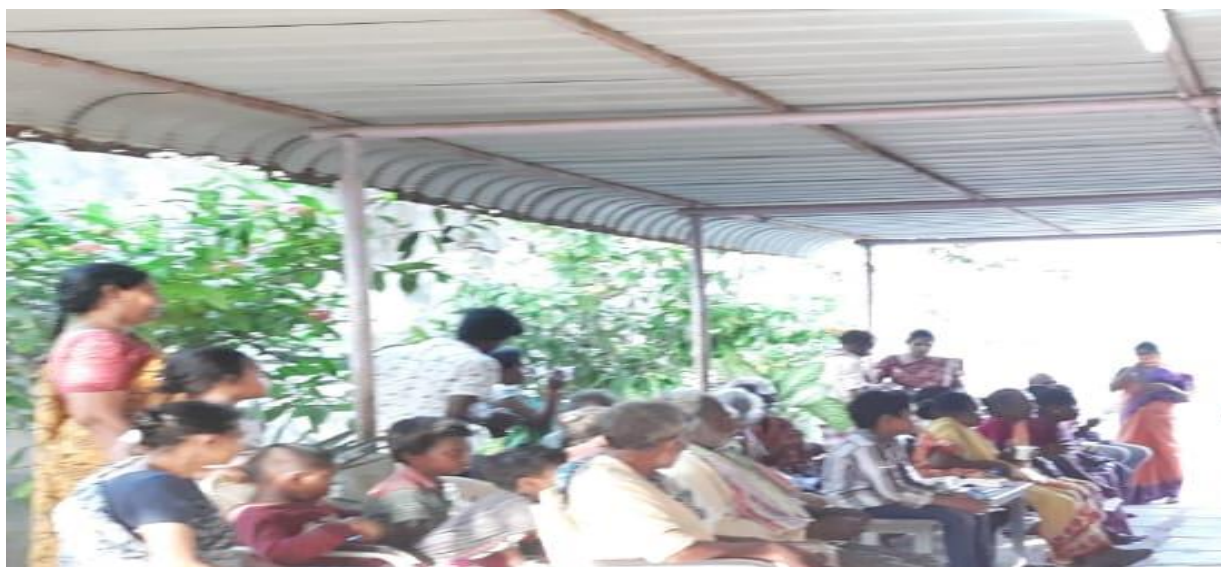
Awareness on Art for Advocacy: Save the Girl Child, T P Gudur on 24 Jan 2022

The Department of OBG Narayana College organized the "Art for Advocacy: Save the Girl Child" event on January 24, 2022, in T P Gudur. This initiative aimed to raise awareness about gender bias and promote the importance of girls' welfare in society. Through various art forms, participants expressed their commitment to advocating for the rights and education of girls. Faculty members and second-year students actively engaged in discussions and activities, fostering a collaborative spirit. The event successfully highlighted the significance of gender equality and the need for effective welfare services. Overall, it served as a platform for community involvement and social change. 65 participants and 42 village peoples are benefited through this program